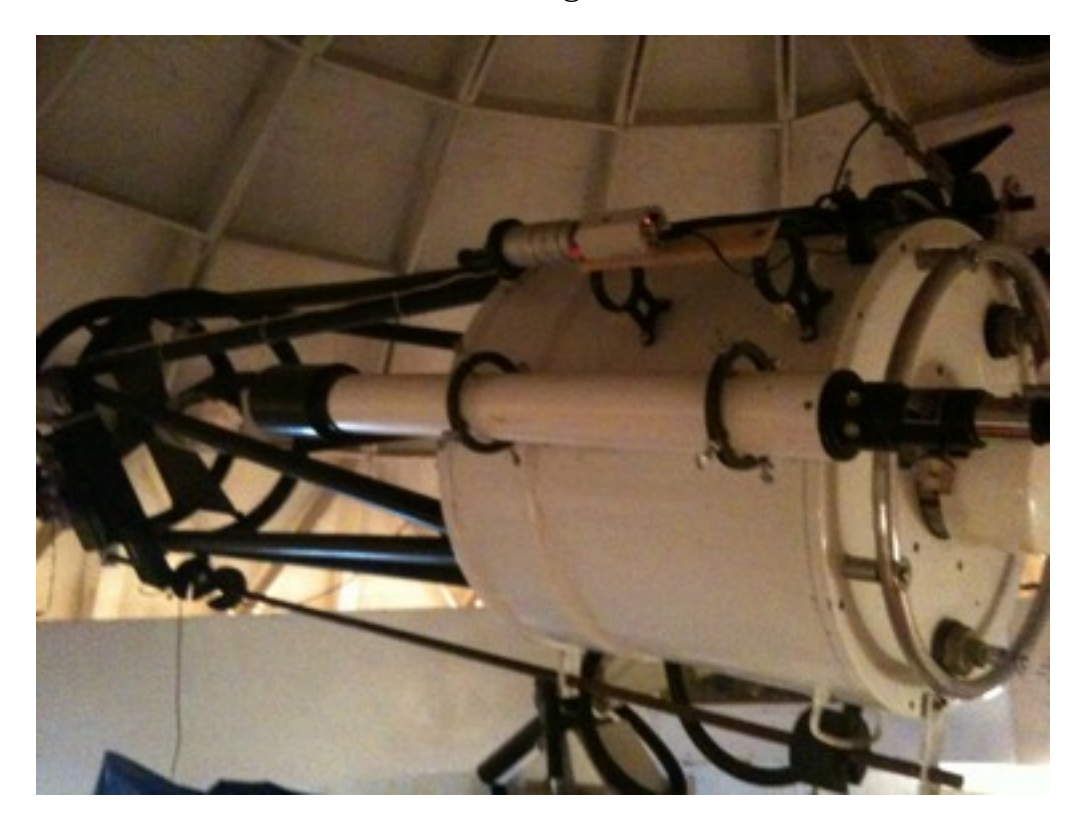
Wes Swift Spring 2011