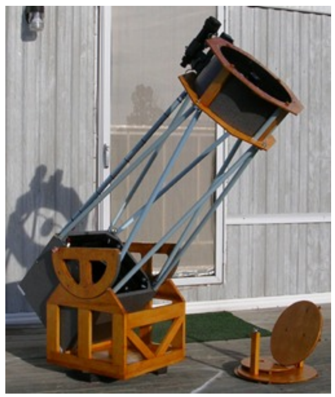
Here's a final picture that didn't make it into last month's article about Bruce Potter's telescope-building project. Bruce: "The finished scope. This one would fit in the 'Kitchen Table Dob' category because it was literally built on my old kitchen table."

We will be holding a work party tomorrow. There has been sparse turnout so far. We need to do haz-mat work, to gather items for turn-in. The leaves need to be cleared. Work parties will be regularly scheduled on the first and third Saturdays of each month. They will usually run from 10 AM to 3 PM, but it will probably end at 2 PM tomorrow.