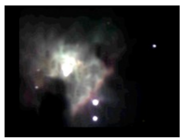
First CCD image taken with the Swanson 21", M-42.

Since "first light" on October 14, the Swanson has been used in three additional observing sessions and a total of three work sessions. Several improvements were made to the general operations. Equipment was moved to the west side of the scope to clear more space for visitors, and a log book was added for recording observing sessions. After an initial work session on Friday 11/24, we were able to attach a Meade DSI CCD camera to take the following photo of M-42: