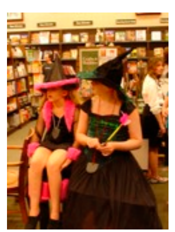
Assorted costumers at the Harry Potter book 7 release event at Barnes & Noble. This month, we held the VBAS Members Meeting there, along with a Sidewalk Astronomy group doing public outreach.