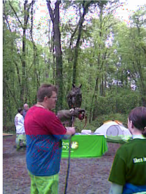
Give a Hoot, Don't Light Pollute!