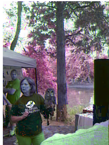
Earth Day at Haye's Nature Preserve Come join us next year!